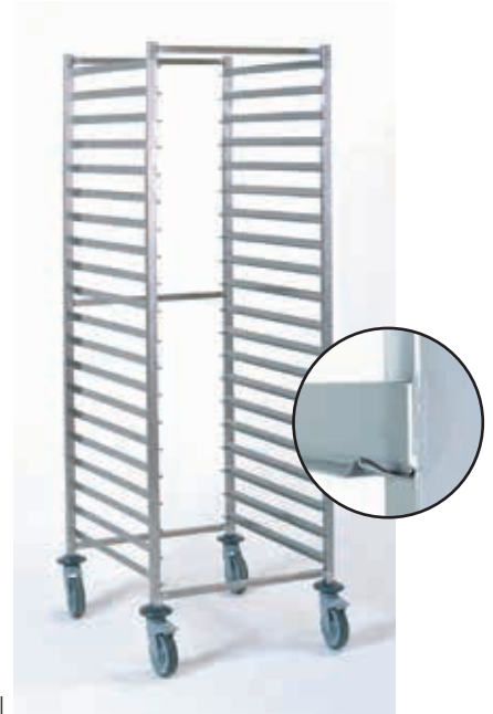
GN 2/1 - 20 levels