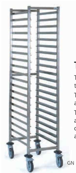
GN 1/1 - 20 levels

The slide bars are continuous welded on an automatic welding bench. The weld seam is performed over the whole length of the bar slide without filler metal. This production process ensures even welds. And above all, exceptional resistance to wrenching.