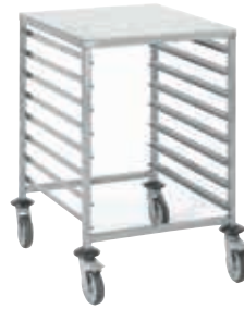
Low trolley with top panel