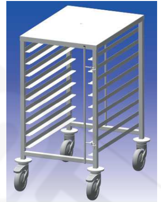
trolley height 725 mm + closing bar